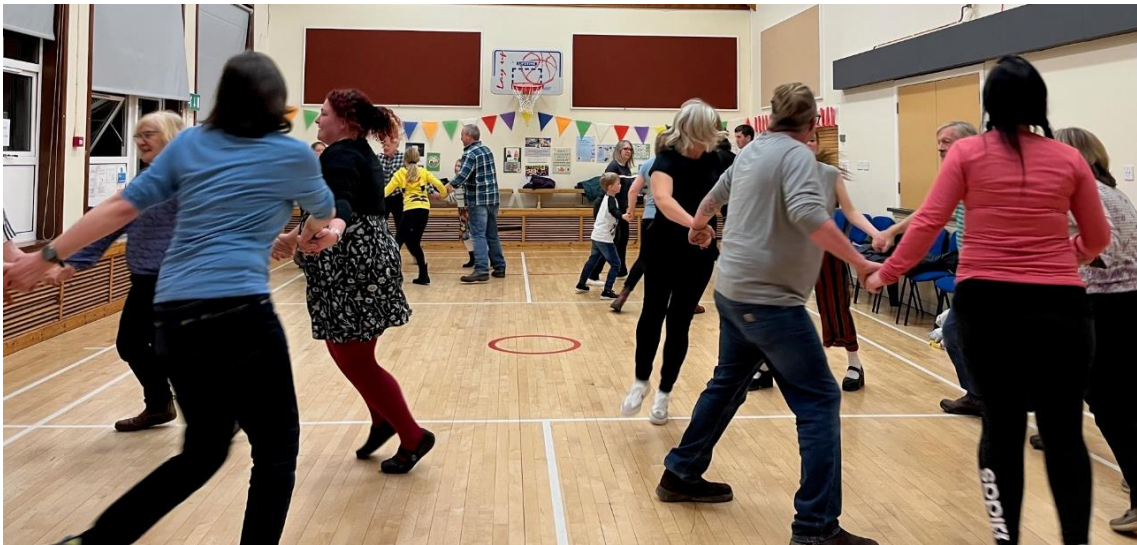
Rousay Traditional Dance lessons in full swing

Funding Outdoor Education in Hoy in 2024