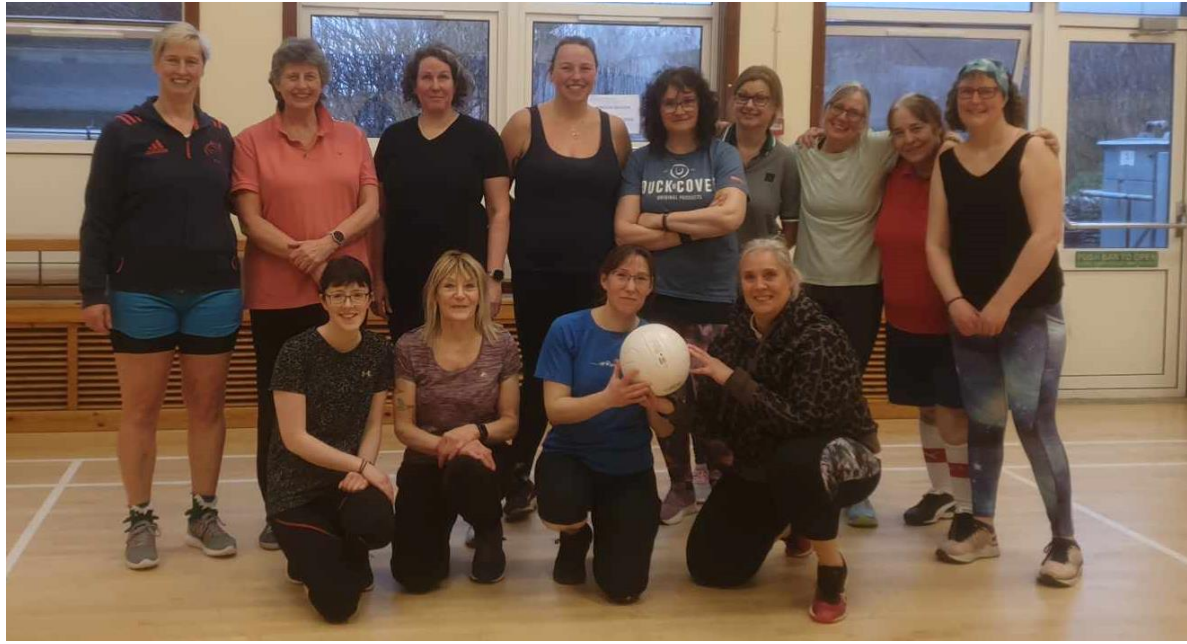
Rousay Ladies Sports Group

Supporting community initiatives remained a top priority this year. Through the allocation of 8 Community Group Grants and 8 General Grants, we proudly supported groups and individuals to organise and host various community events and activities throughout the year.