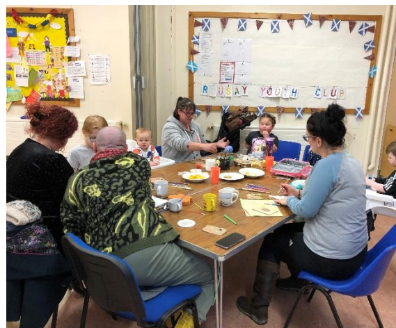
Rousay School, Rousay Ladies Sports & Rousay Play & Stay 'Aal Fired Up' Pottery Day