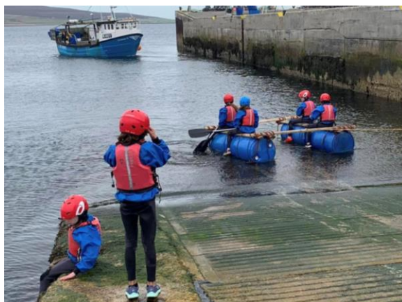
Triangle Club trip to Scapa Flow Museum & Rousay Primary School Outdoor Education