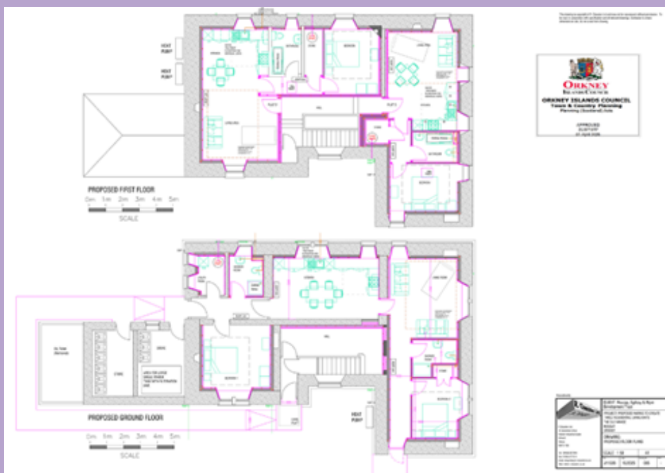
Approved plans for the Manse

We received planning permission for the conversion of the Manse into 3 flats. The final design has been altered very slightly to add an additional shower room in the two-bedroom flat downstairs.