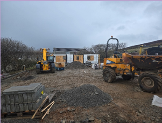
The first new house going up

The contractors are back on site at Johnstons Road and making rapid progress. The timber frames of the two houses are going up and then the external walls will be built.