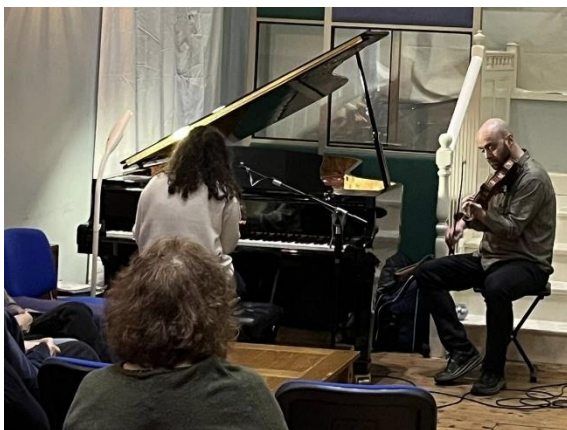
The Crafhub SCIO Grand Piano

Funding towards car park & grounds improvement project