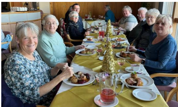
Triangle Club Christmas Lunch