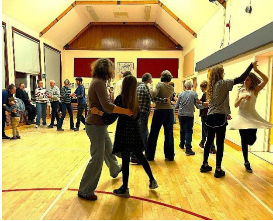
Rousay Traditional Dance Group