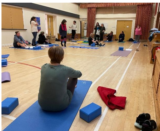
Rousay Yoga Group

Funding a new internet-linked darts scorer for group games