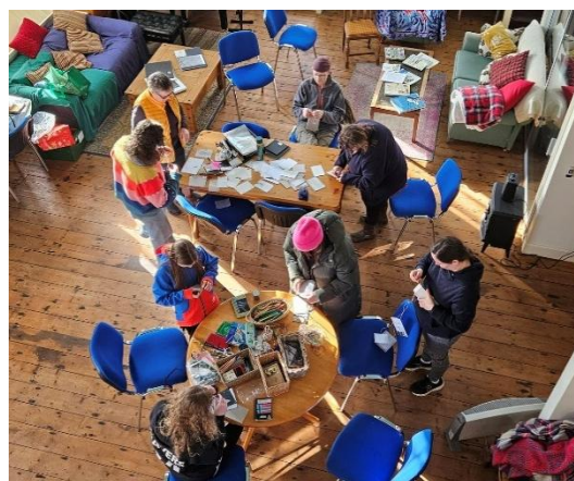
Rousay Sketch Class