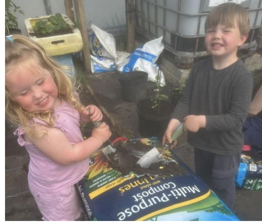
Rousay Allotment Group