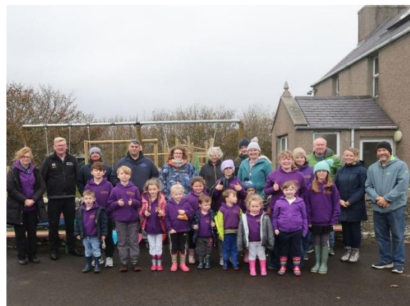
Rousay School Playpark